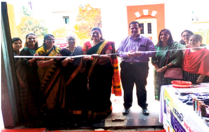
Inaguration of Expo-2023

On the occasion of International Women's Day, SEEDC in association with Chordiya Products (Mastani Group) has organized "Women Expo 2023". The exhibition was organized on 4 th March 2023 at Shivaji Mangal Karyalaya, Kedgaon, Ahmednagar. 30 women entrepreneurs exhibited their products, and ladies from Ahmednagar participated in the exhibition. Total 32 stalls were arranged. The stalls were ranging from Jewellery and accessories, clothing, spices, bags, Solar lamps, herbal products, handmade soaps, bakery items, to food stalls.