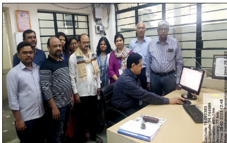
Google Drive -Institutional Repository _ Feb 2023

The IMS Library created a Google Drive of Institutional Repositories (archives), i.e., digital copies of the intellectual output pertaining to learning, teaching, and research. They are GR institutional publications such as journals, magazines, and newsletters, university syllabuses and question papers; research articles, TOCs of journals; PhD theses lists, etc. The web link was shared with all stakeholders via social media platforms and QR codes. The institutional repositories made it possible to collect content in one location, capture it, and provide open access to the intellectual output of the IMS Library for its users.