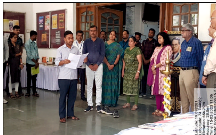
Matrubhasha Diwas & Book exhibition