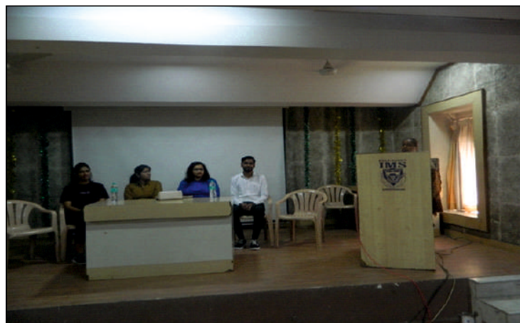
Team members of Centrologic Company