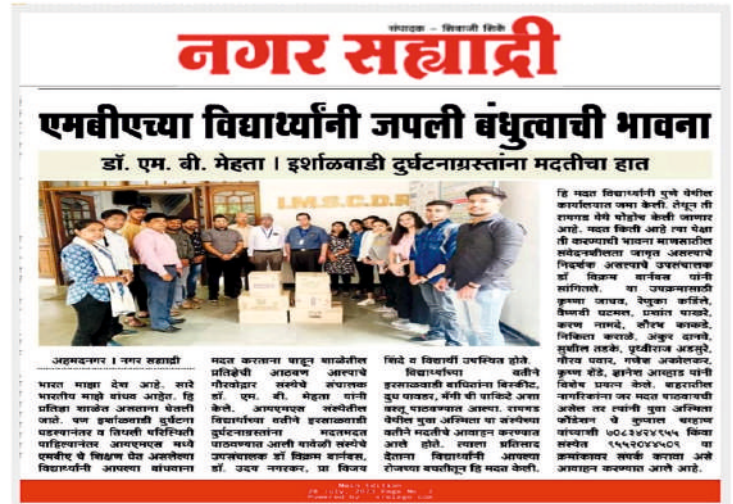
News of Irshalwadi donation

Students of MBA donated food items and grocery items like wheat, rice, dal and many more to the people of Irshalwadi where the flood slide occurred. This drive was organised through Yuva Asmita - NGO on 28 th July 2023.