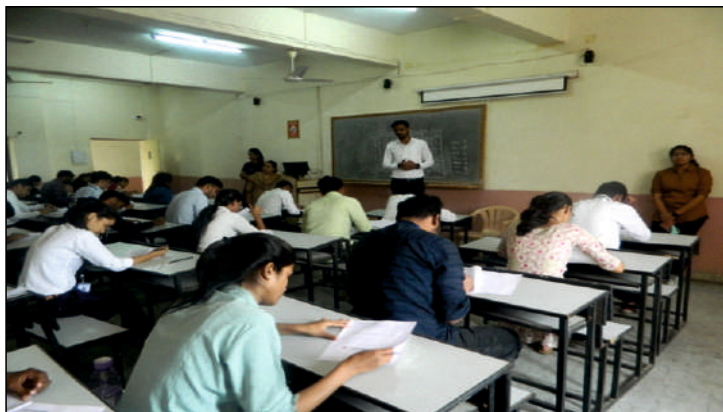
Students giving Aptitude Test