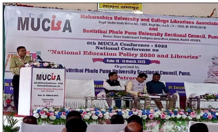
MUCLA Con.Nasik 18-19 Mar 23 -Presentation