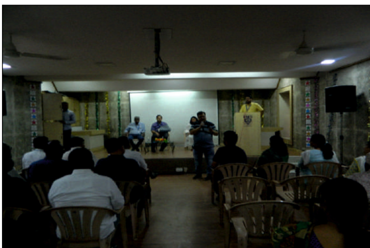
Parents speech at the Parents Teacher Meet