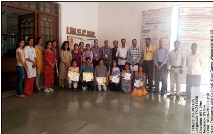
Winners of the Quiz Competition along with the faculty & staff