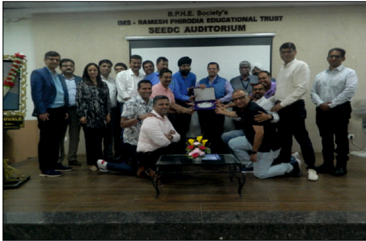
MBA 1996-98 Batch Alumni Meet