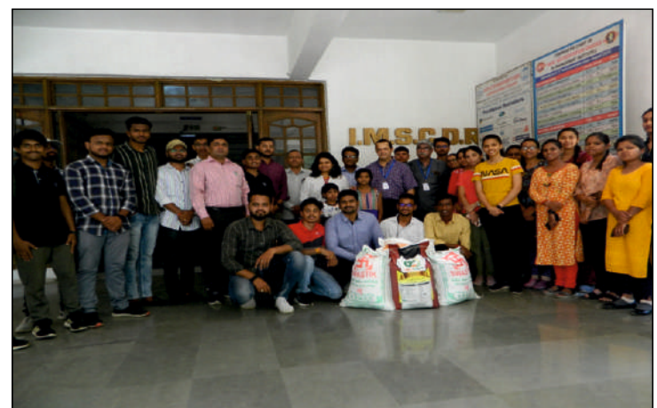
Donation Drive by MBA students

MBA students donated food items like Biscuits and other eatables to the children at Bal Ghar, Pipeline Road, Ahmednagar.