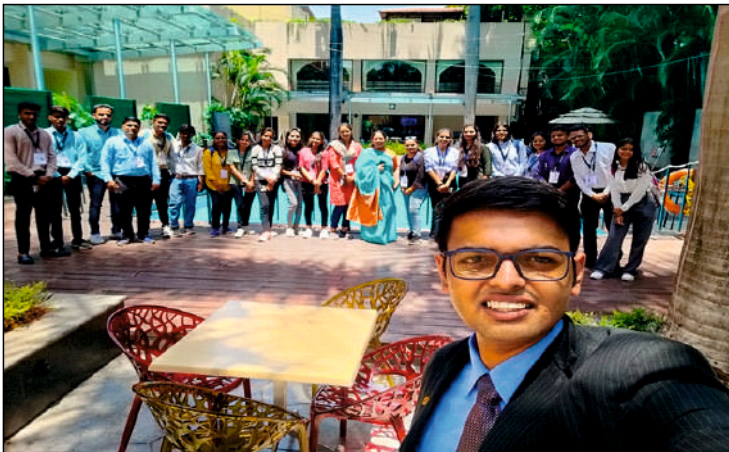
Students at Hotel Blue Diamond