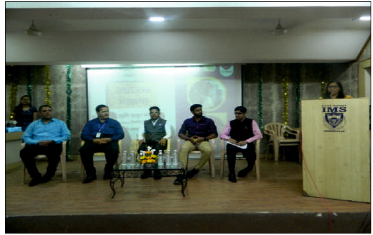
Delegates at Udyogak Melava