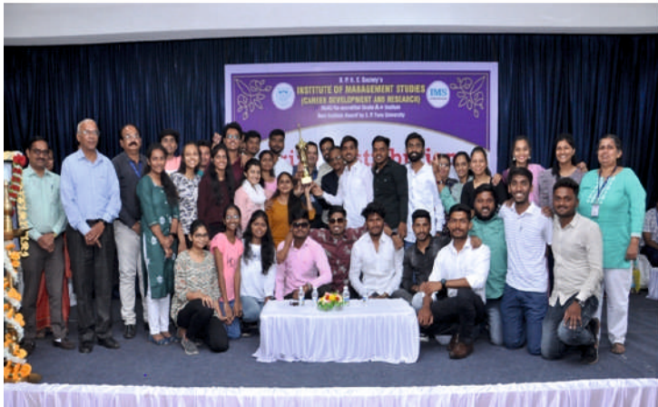
Winners of Annual Day 2023