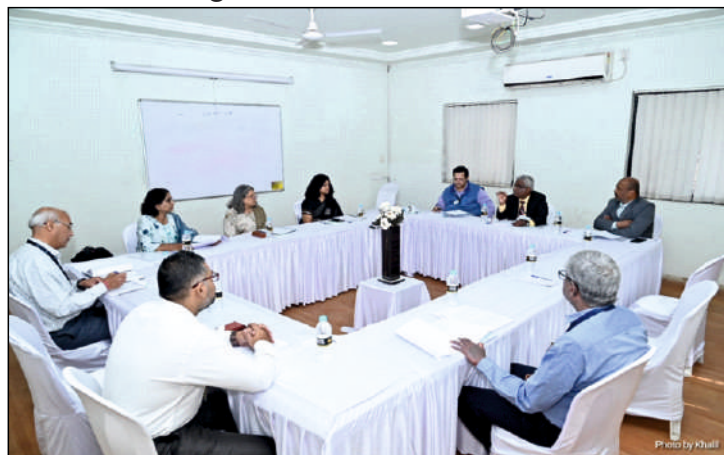
Members at the CDC Meeting

As per section 97 Maharashtra Act No. VI of 2017, there shall be a separate College Development Committee for every affiliated college or recognized institution. The constitution of the Committee & role of the said Committee is given in the said Maharashtra Act.