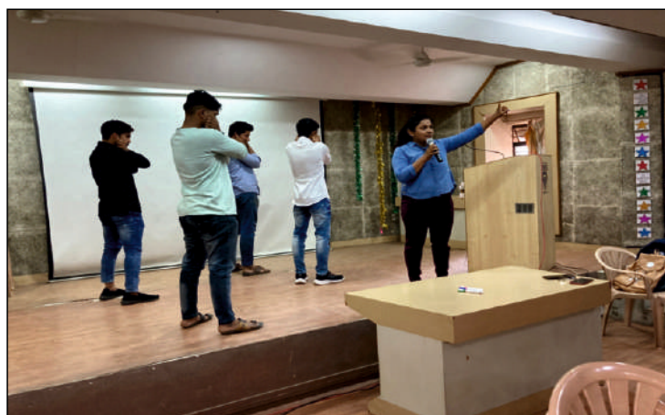
Students performing Asanas at the Workshop